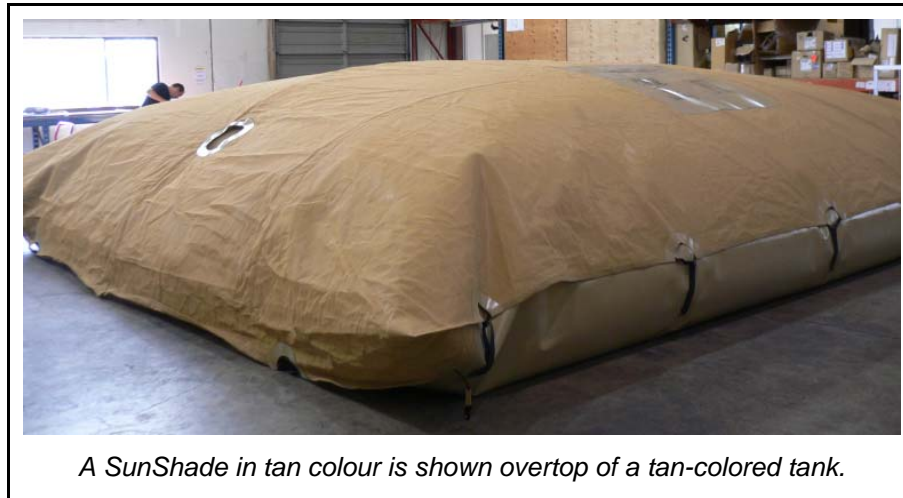
A SunShade in tan colour is shown overtop of a tan-colored tank.

SunShades are designed as a protective cover for collapsible tanks and come in either green or tan colours. Black and white are also available on special order.