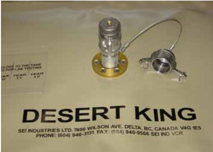
Desert King tank fill/drain vent.