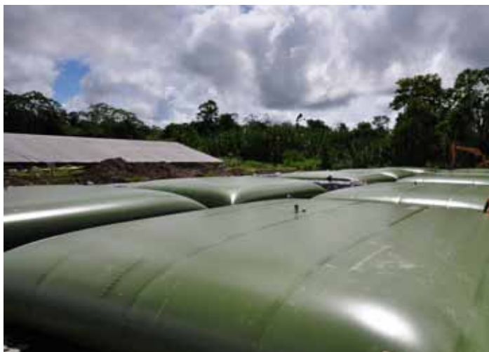
SEI's Jungle King tank farm in Peru. The Jungle King is independently-certified by Intertek.