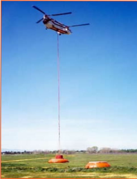
The Torrentula PowerFill is ideal for filling buckets from dip tanks such as the Fireflex Pumpkin Tank shown here.

ADD RAPID SHALLOW-FILL CAPABILITY TO YOUR TORRENTULA VALVE