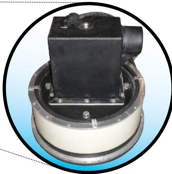
AQUALANCHE VALVE PRE-INSTALLATION VIEW